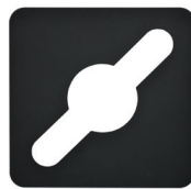
RC-INSERT COM BLX