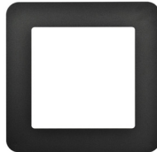
RC-INSERT FLAT TRASH BLX