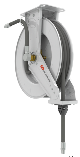
Hose reels are delivered in ceiling mount position.