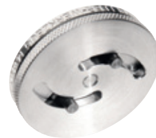
# 468 020/47 2-pin Adjustable Discs