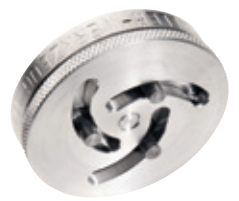
# 468 020/48 3-pin Adjustable Discs

Turning and Pressing all in one movement