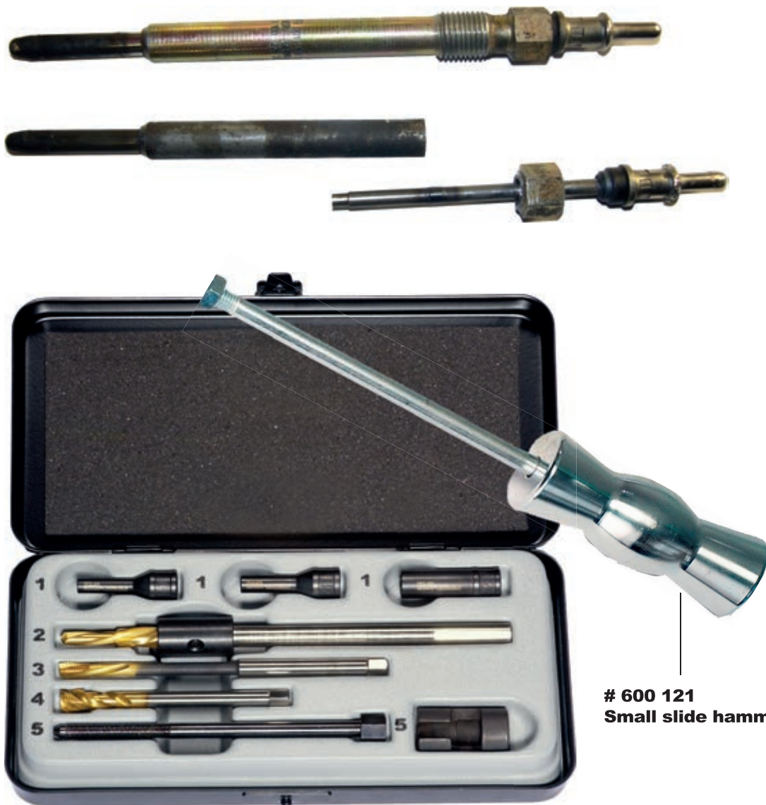
# 600 121 Small slide hammer