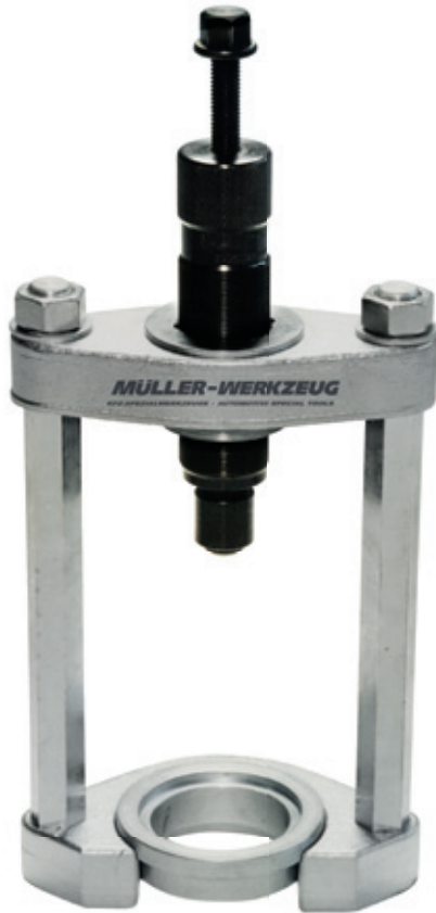
# 609 312