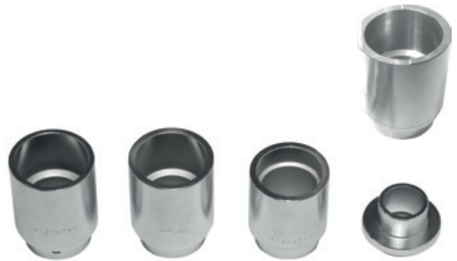
# 609 147/V2