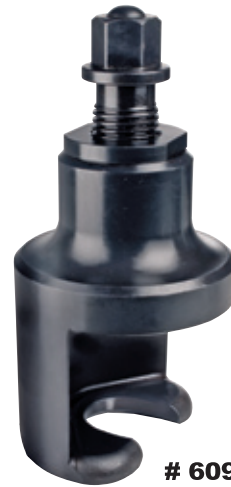
# 609 035