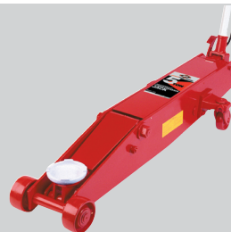
Model 3135 10 Ton Air / Manual Floor Jack