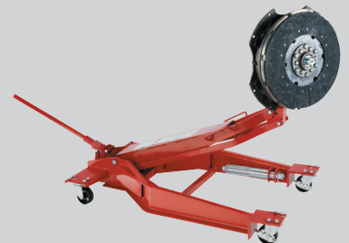
Model 3700 Clutch Jack

Guilderland Center, NY - 1-800-255-0555 - www.affjaxx.com