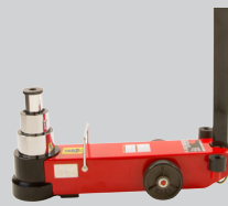
Model 548SD 60/40/20 Ton 3 Stage