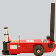
Model 546SD 25/10 Ton 2 Stage