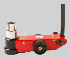
Model 549SD 80/50 Ton 2 Stage

Guilderland Center, NY - 1-800-255-0555 - www.affjaxx.com