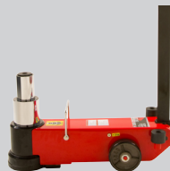
Model 547SD 50/25 Ton 2 Stage