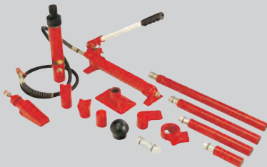
Model 814 4 Ton Collision Repair Kit