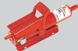
Model 801 Air Hydraulic Foot Pump

Guilderland Center, NY - 1-800-255-0555 - www.affjaxx.com