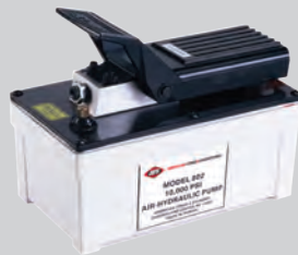
Model 802 Air Hydraulic Foot Pump