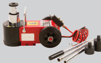
Model 545SD 30/15 Super Duty Axle Jack