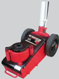
Model 522SD 22 Ton Super Duty Axle Jack