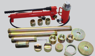
Model 818SD 20 Ton Super Duty Collision Repair Kit

Guilderland Center, NY - 1-800-255-0555 - www.affjaxx.com