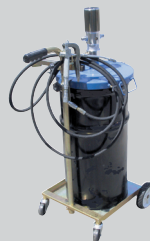
Model 8622A 50:1 Air Operate Grease Unit