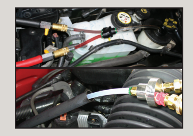
TRANSMISSION (INLINE or DIPSTICK) & POWER STEERING

Multi-function service, transmission fluid exchange (inline or dipstick) or patented integrated power steering exchange