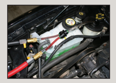
& POWER STEERING FLUID Multi-function service, transmission fluid exchange or patented integrated