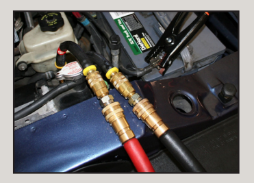
TRANSMISSION (INLINE) Transmission fluid exchange through vehicle's transmission cooler lines