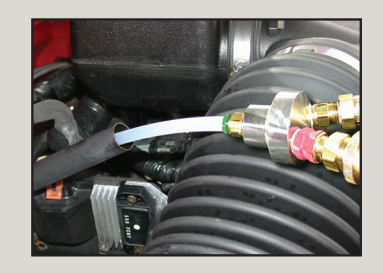
TRANSMISSION (INLINE or DIPSTICK) Multi-method transmission

Multi-method transmission fluid exchange: inline or through the dipstick