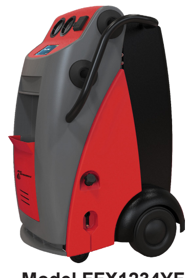
Model FFX1234YF (R1234yf)