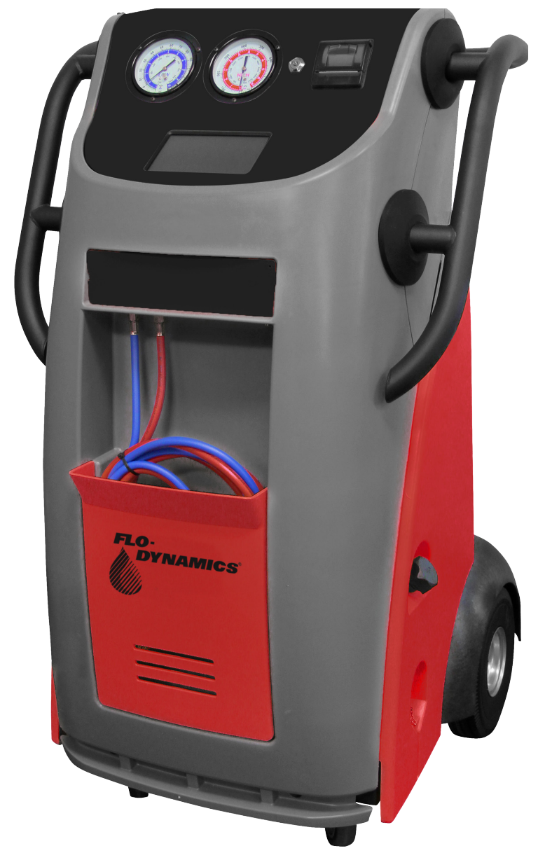
Model FFX134A (R134a)