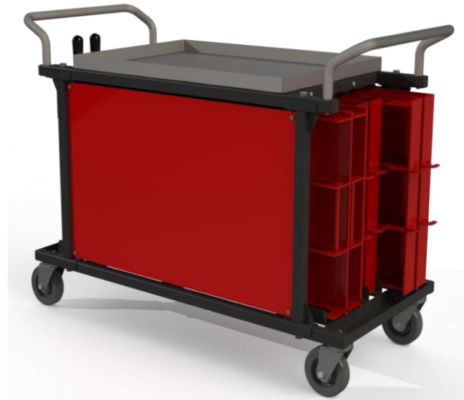
Optional Storage Cart