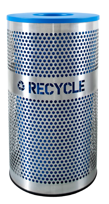
VCR-33 PERF SS