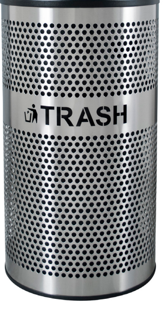
VCT-33 PERF SS