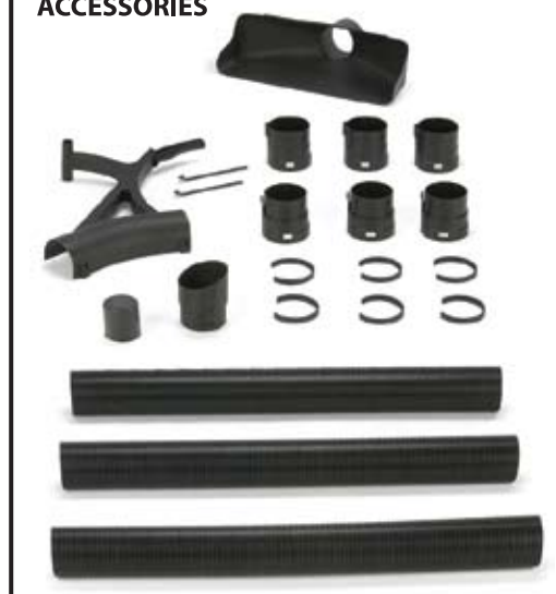
(3) 3' x 3½" LockOn® hoses, hose assist handle, angle nozzle and lawn nozzle.