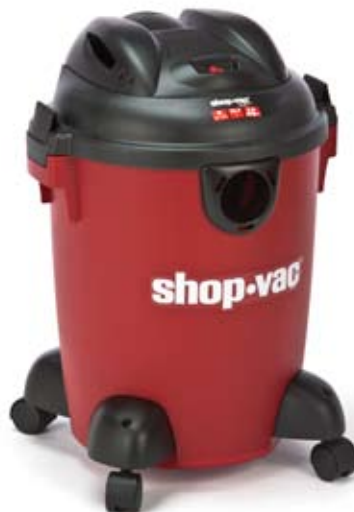
5940600 6 Gallon* 2.5 Peak HP