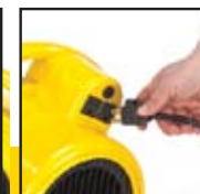
Easy access plug in for connecting multiple units