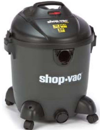
5867400 12 Gallon* 5.0 Peak HP