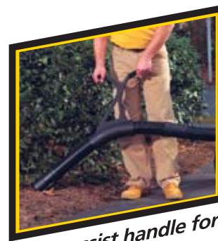
Hose assist handle for quick leaf pick up.