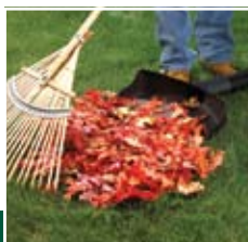
15:1 Ratio leaf mulcher