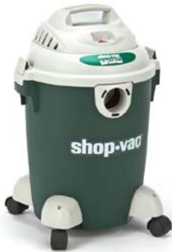
5960600 6 Gallon* 2.75 Peak HP

Easy reach on/off switch conveniently located on top of the unit.