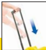
Collapsible transport handle