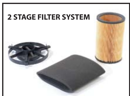
2 STAGE FILTER SYSTEM