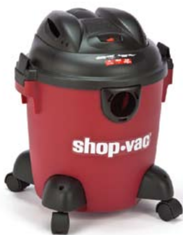
5940500 5 Gallon* 2.0 Peak HP

Inlet accepts 2½" and 1¼" hose for versatile accessory use.