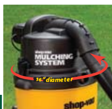
Fits most 16" diameter Shop-Vac® tanks