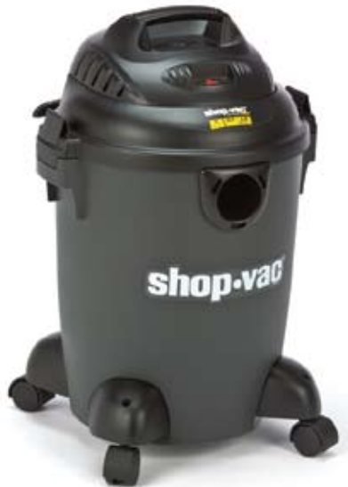
5960700 6 Gallon* 3.0 Peak HP

Easy reach on/off switch conveniently located on top of the unit.