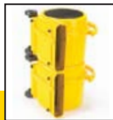
Units are stackable for easy storage