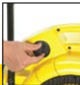
3 speed air control

** Specifications subject to change without notice.