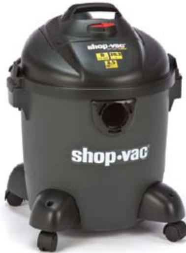
5867300 8 Gallon* 3.5 Peak HP