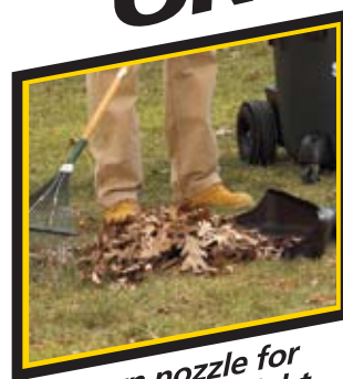
Lawn nozzle for raking leaves right into the mulcher.