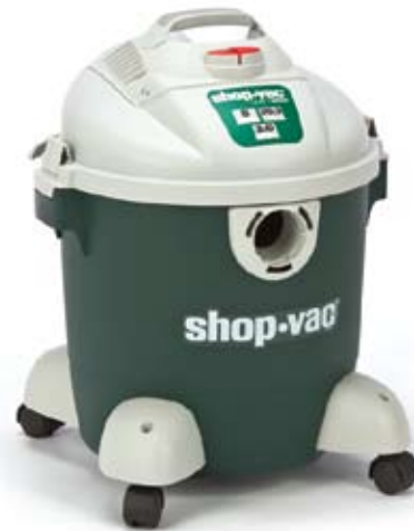
5867000 8 Gallon* 3.0 Peak HP