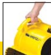
Top carry handle

** Specifications subject to change without notice.