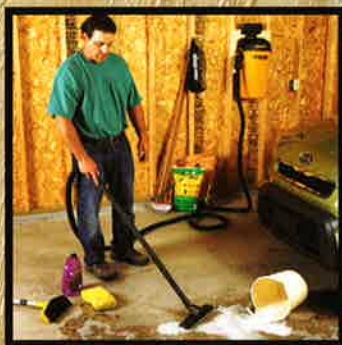
Wet pick up

Specifications are subject to change without notice.