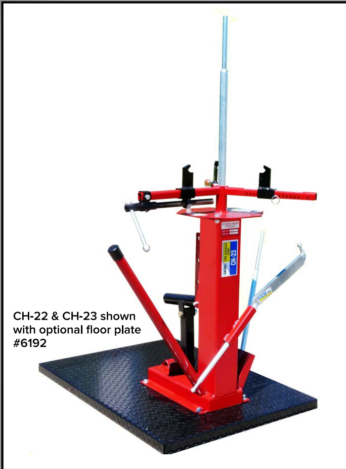
CH-22 & CH-23 shown with optional floor plate #6192