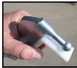
#12488 Wheel Protector (Mounting)