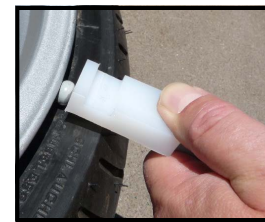
#12488 Wheel Protector (Demounting)